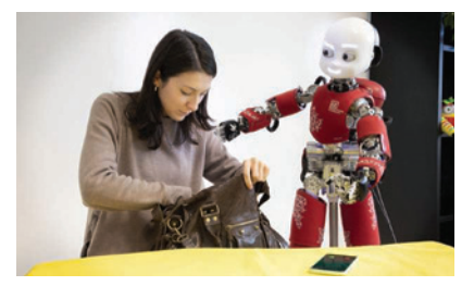
FIGURE 1. The robot understands the need of the human partner (i.e., finding her ringing mobile phone), anticipates her request for help, and selects the most appropriate way to support her by using intuitive communication to direct her attention to the desired object.

Overall, cognitive robotics has the potential to revolutionize various industries and improve our daily lives by creating intelligent machines that can perceive, learn,