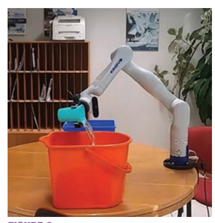
FIGURE 2. The robot understands the object's physical properties and selects the most appropriate kinematics and manipulation action. Details are provided in [5].

Digital Object Identifier 10.1109/MRA.2023.3293303 Date of current version: 11 September 2023